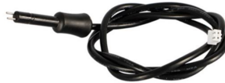
Figure 1: TDS sensor

1L of water. The higher the TDS value, the more dissolved solids the water contains.