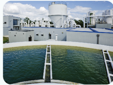
Water Plants, Swimming Pools