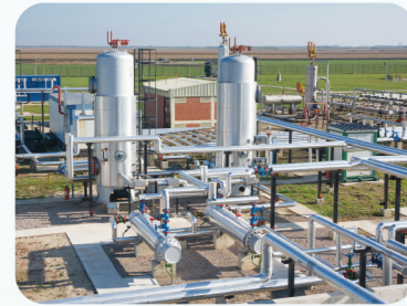
Environmental protection and Industrial Process Control (Chemical, Petrochemical, Chip Manufacturing...)