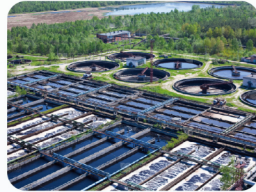
Environmental Water Quality Monitoring, Water Treatment