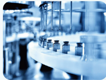
Food Fermentation, Pharmaceuticals